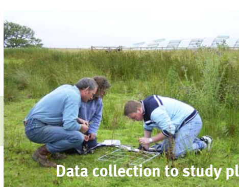
Data collection to study plant distribution and ecology