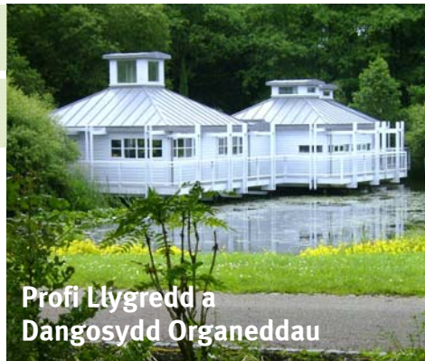
Profi Llygredd a Dangosydd Organeddau

Mae'r tîm yn edrych am wirfoddolwyr brwdfrydig ac athrawon cyflenwi.