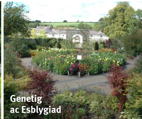
Genetig ac Esblygiad