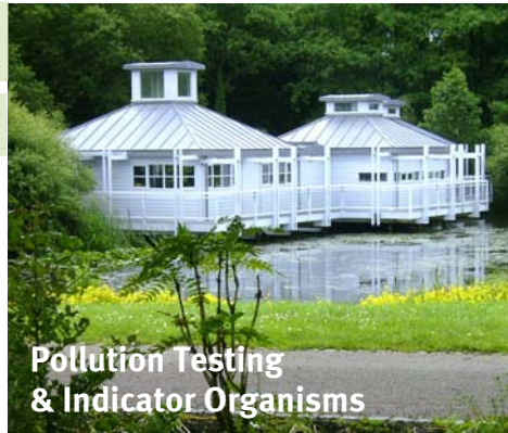
Pollution Testing & Indicator Organisms

Our team is looking for enthusiastic volunteers and supply teachers.