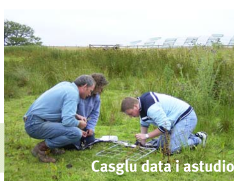
Casglu data i astudio planhigion ac ecoleg